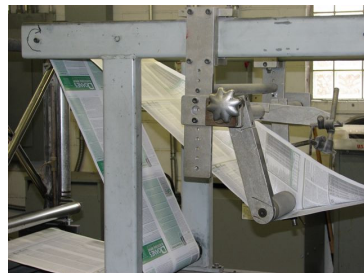
Clockwise from above left: MCS Wide Array Inkjet; the 3-step process; buckle folding; plow folding

With in-line inkjetting and folding, and using invisible ink barcodes in the matching process, we've eliminated many of the obstacles we've faced in production and you've faced in cost that have made you settle for a window package.